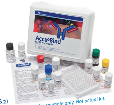
Photo for example only. Not actual kit.